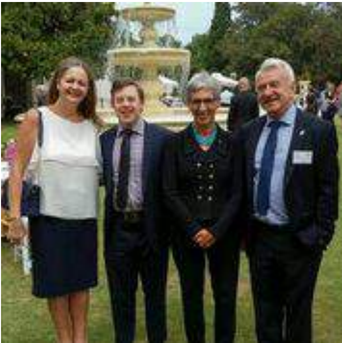
The "Award Day" at Government House