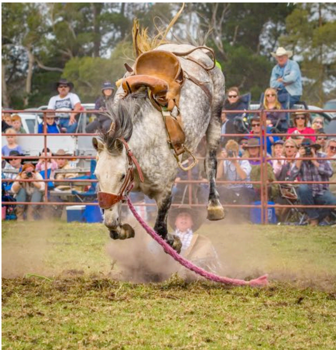
"Horse 1, Rider 0"

There were very dangerous and exciting rides but you have to give the winning score clearly to the bucking bulls and horses. In the "A" grade bull rides no rider could last more than 2 seconds! Message for those who would attend next year – arrive early for the choice viewing spots because they are quickly taken up by other camera clubs.