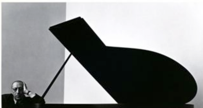
"Igor Stravinsky by Arnold Newman"

Who would of thought of this composition as a portrait? Lines, shapes and a figure – thinking outside the box - brilliant!