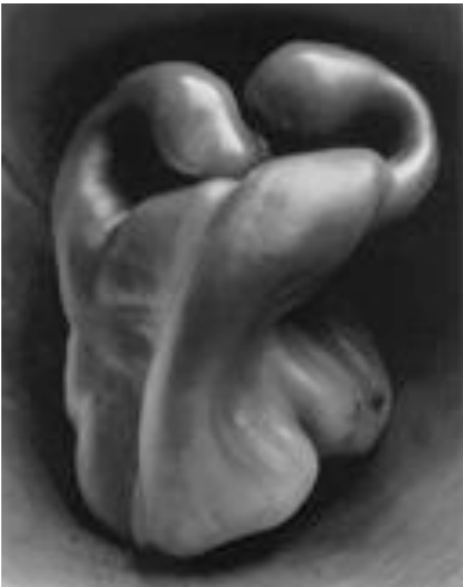
Edward Weston – Pepper

I will start it off with a very famous image by Edward Weston [if you have not heard of Edward Weston then shame on you! He is up there with Ansel Adams]