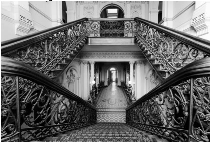
A picture of the mansion interior by Paul Franks