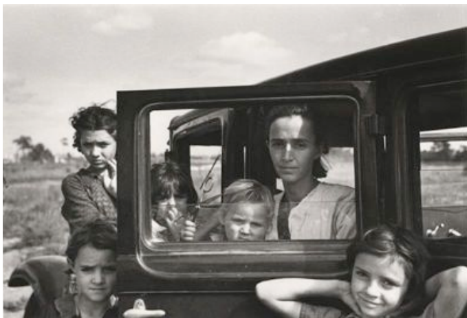
"Oklahoma Migrants, 1936" by Arthur Rothstein

Yet again no one has submitted a photograph of interest or excellence and so I have had to spend hours and hours trawling the Internet for your interest and edification!