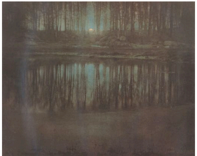
"The Pond - Moonlight, 1904" by Edward Steichen

Rothstein was recognized as one of America's premier photojournalists. His photographs ranged from a hometown baseball game to the drama of war, from struggling rural farmers to US Presidents.