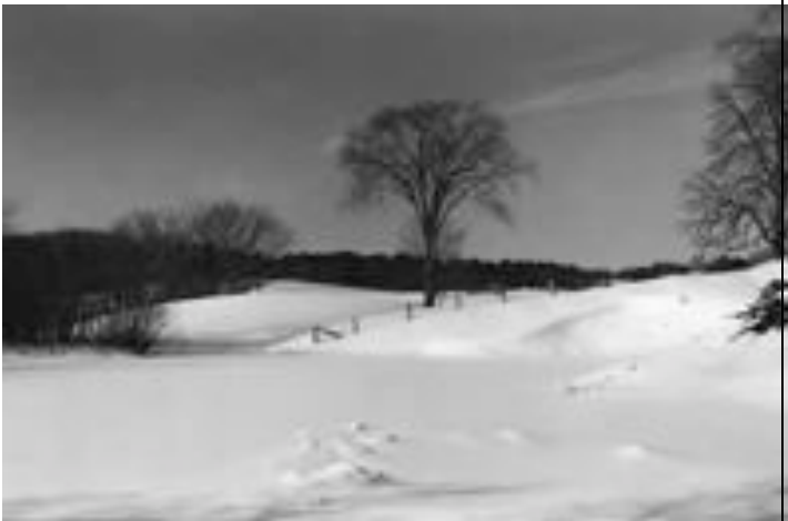
"New England Landscape In The Snow" – Art Sinsabaugh [ca 1970's]

Selected simply because you could sit and look at this restful scene for hours – soft colours and good composition.