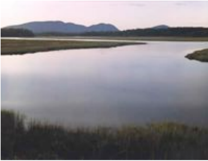
"Mount Desert Tidal Marsh" by Eliot Porter

Nothing from the members so here is my take - again!