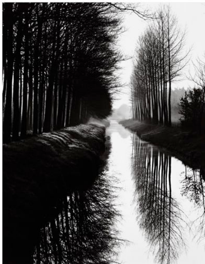
Brett Weston – Unnamed [but probably France]